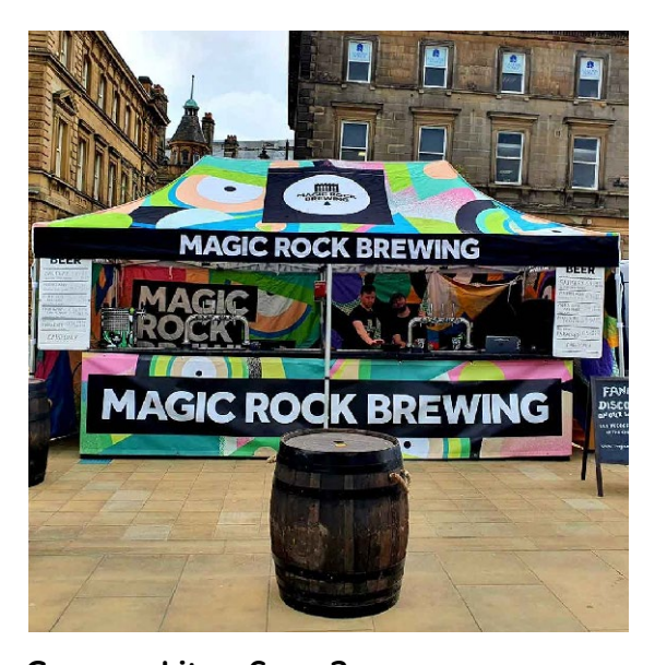
Canopro Lite - 6m x 3m