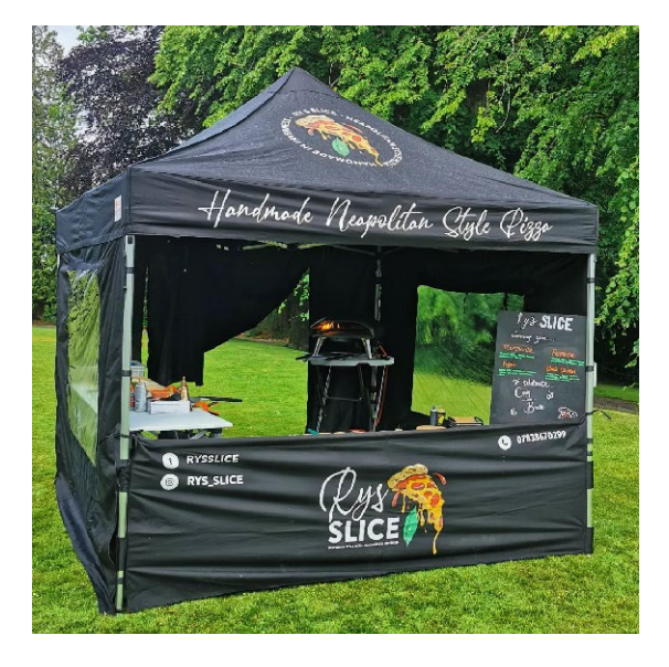
Canopro Lite - 3m x 3m

A high-quality pop-up gazebo is the foundation of your setup. Surf & Turf offers a range of shelter options tailored for mobile caterers: