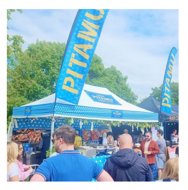
Canopro Lite - 4.5m x 3m