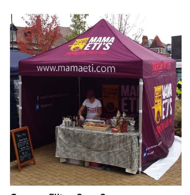
Canopro Elite - 3m x 3m